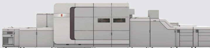
Océ VarioPrint i300 Sheetfed Inkjet Press

Building on the success of its new 100-page-per-minute flagship, the Canon imagePRESS C10000VP press, Canon is now launching the Canon imagePRESS C8000VP production press. Incorporating the same advanced technology as the Canon imagePRESS C10000VP press, the Canon imagePRESS C8000VP press delivers an equivalent combination of outstanding quality, predictable color consistency, and flexible media handling at constant speeds of up to 80 pages per minute.