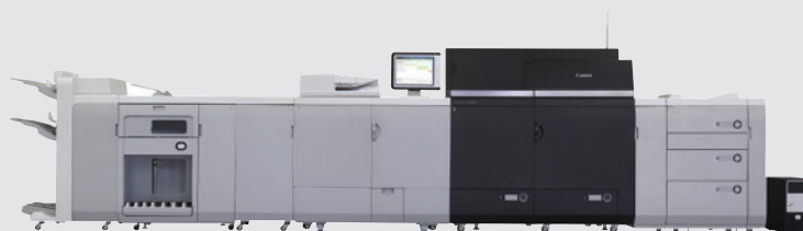
Canon imagePRESS C10000VP Press