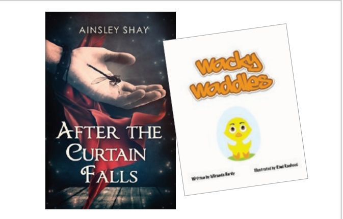
Ainsley Shay and Miranda Hardy books will be printing on the Océ ColorStream 3900 continuous-feed inkjet printer.

Also during Graph Expo 2014, Océ PRISMA® workflow software and third-party partner products will be fully integrated with each other to help develop and drive a variety of applications to the Océ ColorStream 3900 printer. The production print software products that are being highlighted include Océ PRISMAproduction software, Océ TrueProof® software, GMC Inspire, and color management software tools for the inkjet platforms.