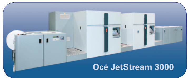
Océ JetStream 3000

As the transaction market deals with the legacy of mainframe applications, transactional printers need better ways to handle, store and reprint mainframe-generated AFP documents. Retrieving a complete AFP document from the mainframe involves resource managers and other applications. The new AFP-to-PDF component converts a mainframe AFP file to a fully composed, highly portable, more compact PDF file that can be easily stored