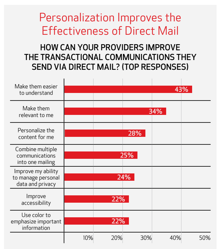
N= 4,000 Consumer respondents in North America and Western Europe; Multiple responses permitted

Print continues to play a key role in driving customer engagement, but it is only one component of a truly immersive experience that must include a seamless combination of traditional, digital, social, and mobile interactions. The most successful PSPs and in-plant operations are reviewing their touchpoint capabilities with an eye toward adding more capabilities directly or via partnerships.