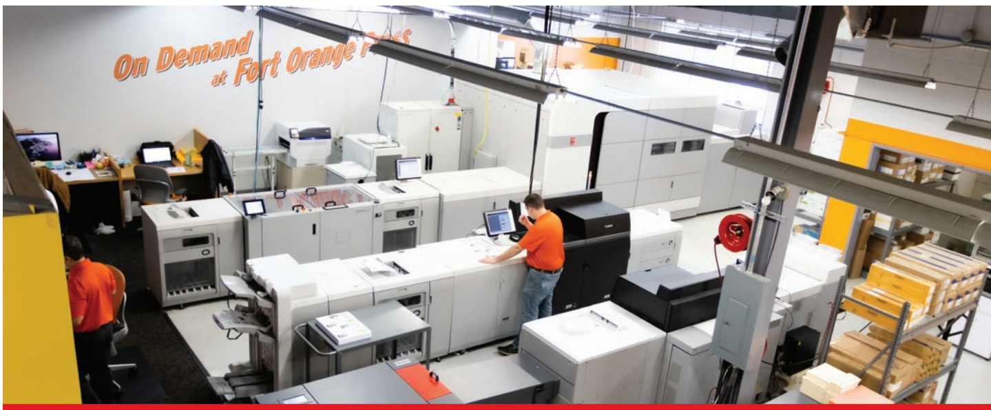
In addition to two Canon ColorStream series inkjet web presses, Fort Orange Press utilizes a Canon VarioPrint i300 full-color sheetfed inkjet press, Canon imagePRESS C10000VP full-color cutsheet toner presses, and Canon varioPRINT 6000 monochrome cutsheet toner presses.

For Fort Orange Press, a digital web solution—first toner-based and then inkjet with its first Canon ColorStream press—became necessary as volume grew.