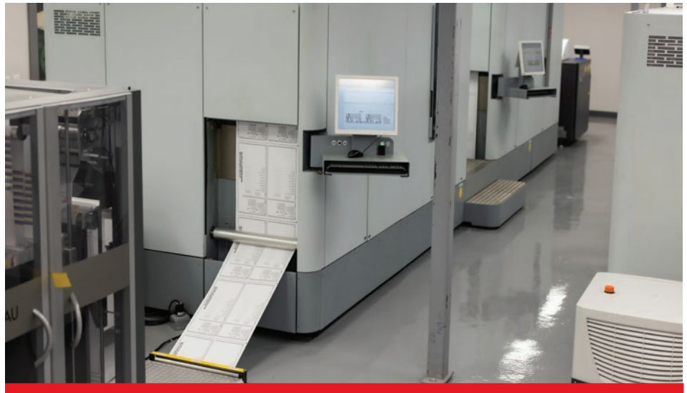
Considered the most reliable digital inkjet web press in the industry, Fort Orange Press uses two Canon ColorStream series presses, enjoying speeds of up to 417 linear feet per minute and 1,200 dpi perceived image quality.

The investments Fort Orange Press made to respond to the tremendous growth in vote-by-mail demands became an opportunity to leverage its capabilities, processes, and data management skills to expand into new directions. The company has developed valuable expertise in the data aspects of variable data mailing projects that require a fast turnaround time, highly accurate and verifiable mailing, and transparent reporting. The data handling, high-speed color variable data printing, intelligent inserting, track and trace capabilities, and real-time reporting throughout the mail production process are all highly transferrable to other large volume transactional and transpromotional print projects that are common in financial, healthcare, non-profit, and higher education vertical markets. From a positioning perspective, these expanded and refined services have not only enabled Fort Orange Press to do more business with existing customers, but also to grow its