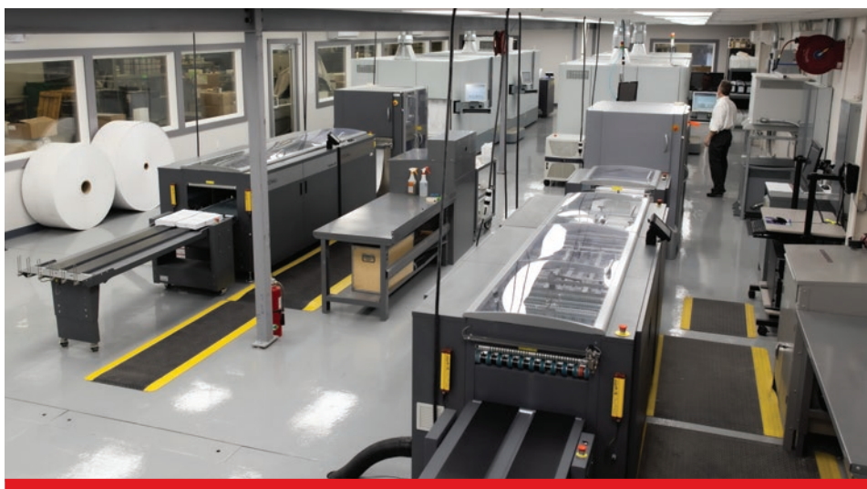
With a massive increase in the print volume and variable data complexity of absentee ballots in the 2020 election, Fort Orange Press relied heavily upon two Canon ColorStream inkjet web presses configured with inline trimming, perforating, and stacking capabilities to meet the individual time demands of its Boards of Elections customers.

of voters nationwide used vote-by-mail in the 2020 general election compared to 20.9 percent in the 2016 general election—more than a twofold increase! "Our workflows had to be absolutely airtight and perfect," Robert says. "As my dad used to say, 'The business of ballot printing is the equivalent of sending a rocket ship to the moon. You only have one shot. It has to be right on.'"