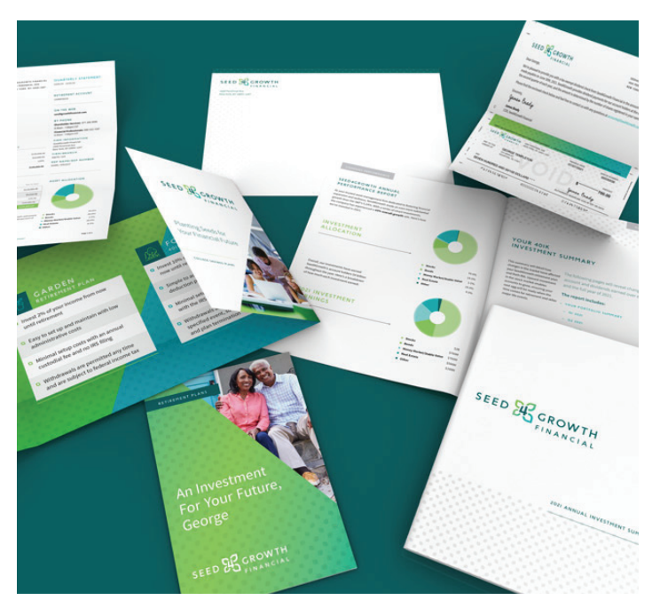
The ColorStream 8000 can print a broad variety of applications from brochures to booklets to transactional materials.

Jansen also points out that carrying through each generation of the ColorStream is Canon's more than 40 years of experience in developing production digital presses and its commitment to integrating customer requests in product development. Another validation point of Canon's commitment to innovation is that for 36 years, it has ranked in the top five for the number of U.S. Patents issued<sup>2</sup>.