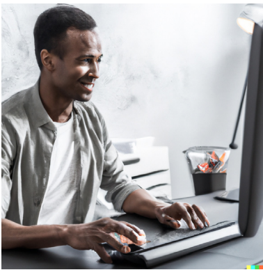
Photo of a brown-haired man 30 years old using design software on a computer