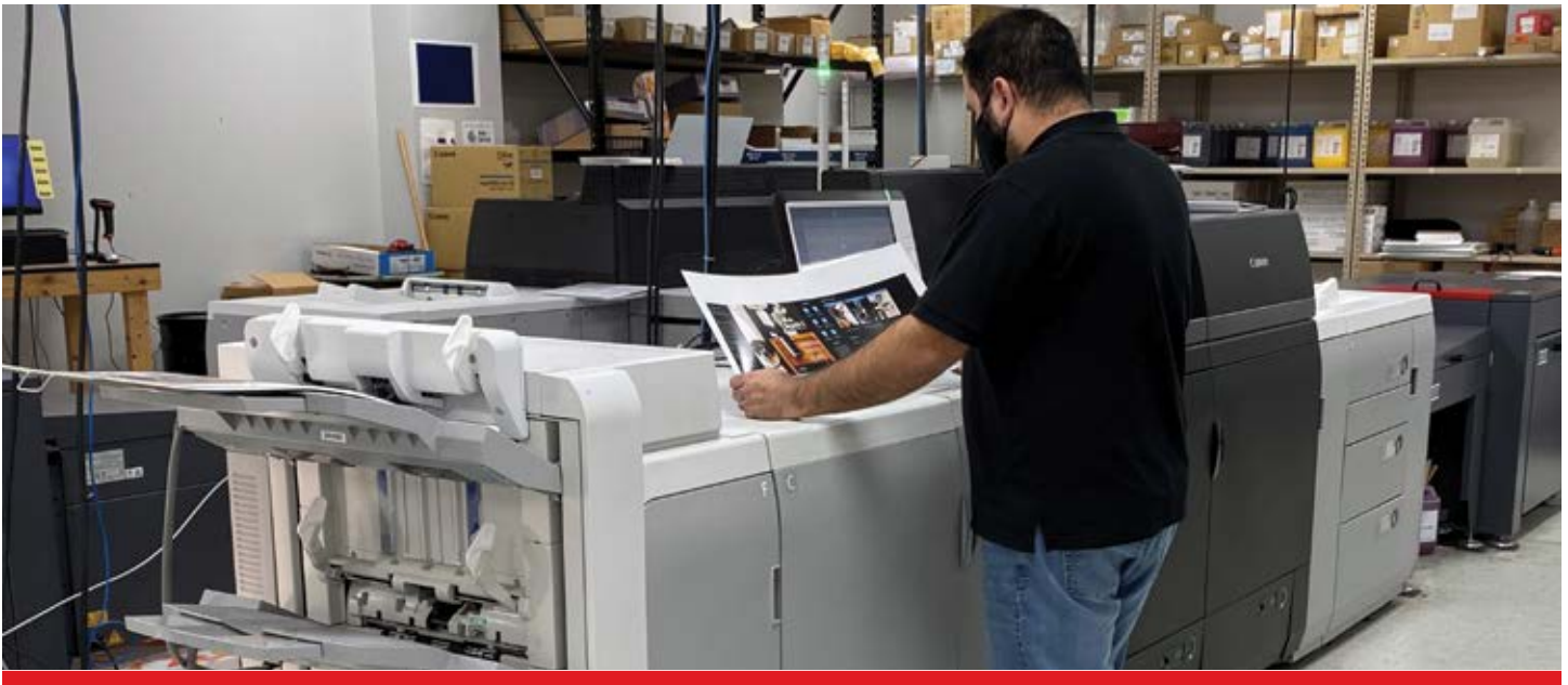
The Canon imagePRESS C10000VP cutsheet color toner press is equipped with a long sheet feeder to print up to 13" x 30" paper.