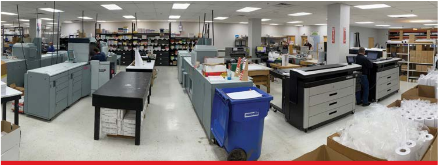
Camelot utilized Canon's expertise to optimize the layout of its new 25,000 sq. ft. space for a streamlined, efficient workflow.

recommended adding GBC punching units to two of the varioPRINT 6000 TITAN presses. "These high-speed punches are inline with the press, so we can run books 1-up rather than 2-up. This eliminates the separate cut and punch steps we had with our older printers," John says. "Now the booklets come out printed, trimmed, and punched. All we have to do is run them through a binding machine, and we're done!" And thanks to PRISMAprepare document preparation software, the image is automatically shifted on the sheet to allow for the punched area while WYSIWYG view ensures correct output the first time.