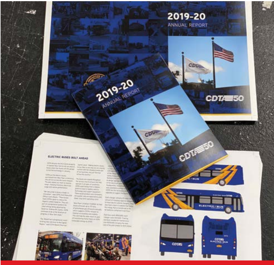
Camelot efficiently produces saddle-stitched booklets by equipping the Canon imagePRESS C10000VP color digital press with an inline Canon Saddle Finisher for a white-paper-in, finished-product-out workflow.

efficiency. Once the input and output profiles are defined and the media linearized and calibrated for the original job, there is no additional setup time for reprints. The results will be the same whether the reprints are one month or one year later. "It's a way easier process than it used to be," John says. "Before transitioning to Canon, trying to match color on our old toner-based machines three months later was such a nightmare. Now we don't even think about it. It used to be a big deal. We used to get nervous. With our new Canon presses, we simply pull up the file, send it to the printer, and it's done. Before upgrading to Canon presses, color matching used to be a huge problem with reprints. Now it's a non-issue."